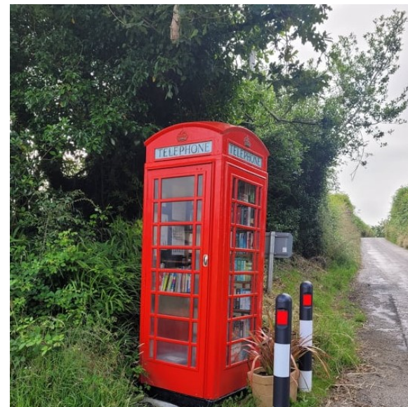
Phone box library, Trekener